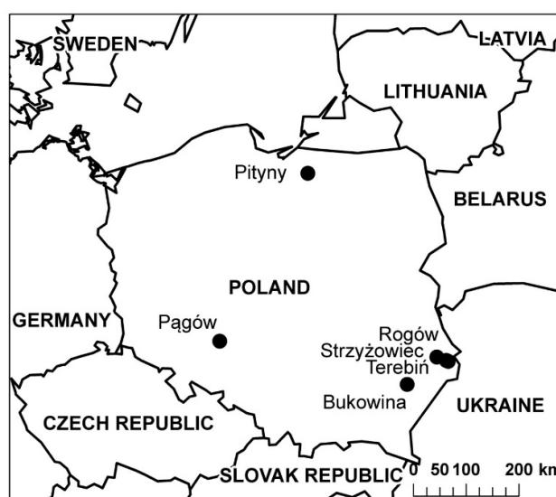
Figure 1. Locations of field experiments.

In 2017–2019, eight field experiments with maize for grain were conducted: four in 2017 (Pagów, Pityny, Rogów, and Strzyżowiec), 2 in 2018 (Rogów and Terebiń), and two in 2019 (Bukowina and Rogów) (Figure 1). The experiments were conducted on following soils: Pagów–Albic Podzols (sandy loam: clay–10%, sand–55%, silt–35%); Bukowina (loam: clay–20%, sand–35%, silt–45%), Pityny (sandy loam: clay–12%, sand–64%, silt–24%), Rogów (silty clay loam: clay–29%, sand–20%, silt–51%), Strzyżowiec (loam: clay–26%, sand–30%, silt–44%) and Terebiń (clay loam: clay–27%, sand–26%, silt–47%)–Endocalcaric Cambisol [27].